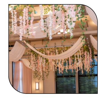
VINES & FLOWERS $500-$1000

Your choice of Gold, White, Black, Blush Pink, Dusty Blue, Burgundy, Emerald Green, Red, Or combination of colors.