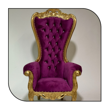
THRONE CHAIRS $175