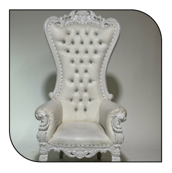
THRONE CHAIRS $175