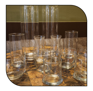
VASES - FREE

12 Tall & 12 Short Lanterns Available with Champagne Hydrangeas and/or LED Pillar Candles