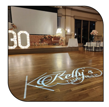
PROJ'D MONOGRAM $300-$350

Photography experience, where memories are not just captured but delivered instantly! Imagine your guests arriving, effortlessly reaistering, and then receiving their beautifully taken photos within minutes.