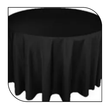
LINENS STARTING AT$15EA

(8) Available provided with LED candlesticks. We suggest client to bring AAA Batteries just in