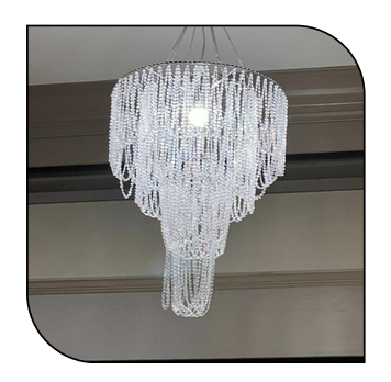
LARGE BEADED CHANDELIER - $75

Choice of White, Baby Blue, Blush, Emerald, Gold, Burgandy, Lavendar drapes