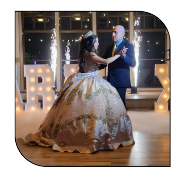
COLD SPARKLERS $2.000 - $2.250

Includes effects tech, dry ice, licensing & insurance