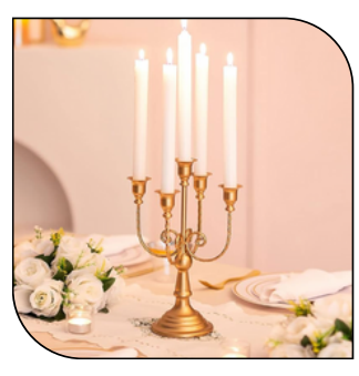
CANDELABRAS - FREE

(25) Bud Vases. Mix of sizes that can be used with client provided flowers