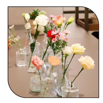
BUD VASES - FREE

Mix of sizes that can be used with client provided flowers, floating candles, etc