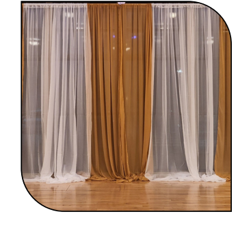
STAGE BACKDROP $150-$200

Chair covers, sashes, runners, and other specialty table linens available. *Request Consultation*