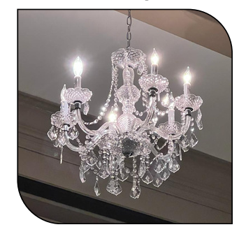
SMALL CANDLESTICK CHANDELIER - $60

(7) Available A Min of 5 Chandeliers must be purchased if ceiling drapes is not purchased.