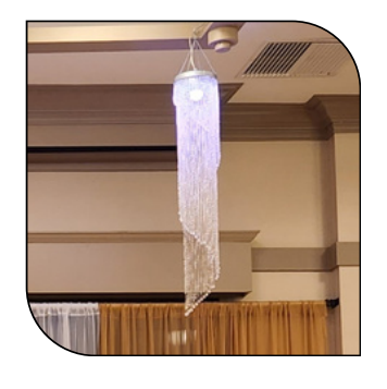
SMALL BEADED CHANDELIER - $50

(1) Available A Min of 5 Chandeliers must be purchased if celling drapes is not purchased.