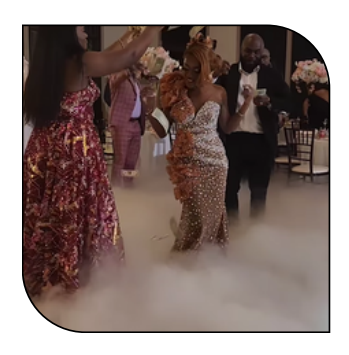
DANCE ON CLOUD -$350

Choice of static or animated design. Setup from the ceiling for a clean, stand free design