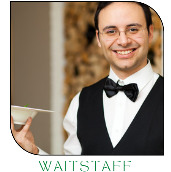
$30/HR PLUS $100 BOOKING FEE

TABC Licensed with Liquor Liability Insurance Our waitstaff can help serving, replenishing, Will require booking additional hrs for setup/bkdwn