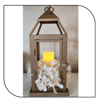
LANTERNS - FREE

However we have some amazing add-on items that can elevate your event and can help fill in the gaps you are not finding with your own vendors.