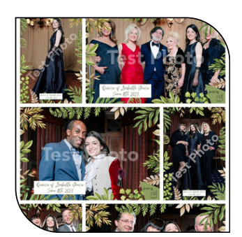
INTERACTIVE PHOTOGRAPHY $250/HR (4HR MIN)

Add up to (10) uplights to your backdrop or around the room