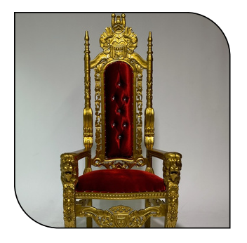
THRONE CHAIRS $175

However we have some amazing add-on items that can elevate your event and can help fill in the gaps you are not finding with your own vendors.