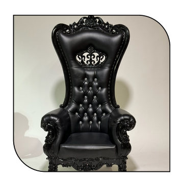
THRONE CHAIRS $175