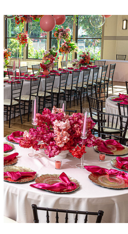
BRINGING YOUR VISION TO LIFE www.accasiaevents.com